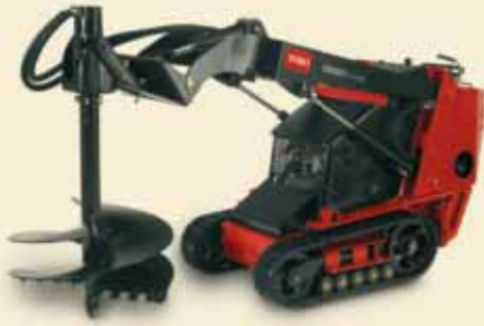
TX 427 Wide Track