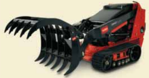
TX 525 Wide Track